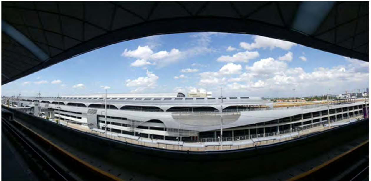
Depot at Khlong Bang Phai